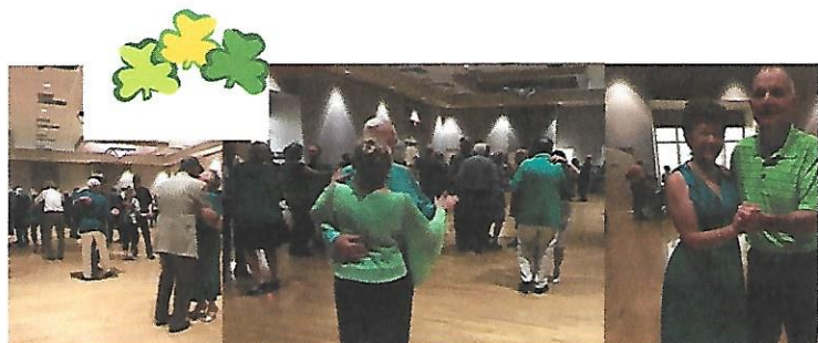
March 16: St. Pat's Variety Dance was a huge success with approximately 300+ attendees.

* Please be considerate of those attendees who are allergic to perfumes and strong scents.