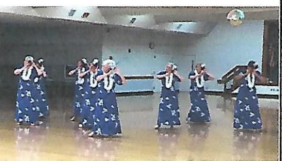
◀Members and guests enjoyed the hula dancers from Nani Komohana Tutus of SCW during break time at our Hawaiian Theme Dance.

Come to our dance on June 30 and enjoy free hot dogs during the break. Invite your friends and neighbors. Even if they don't dance, we guarantee they'll enjoy the music!