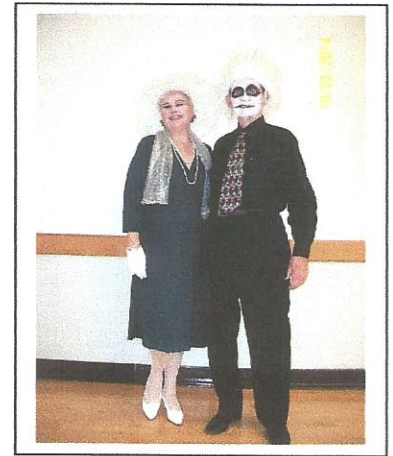
*Who are these people decked out in their favorite costumes?